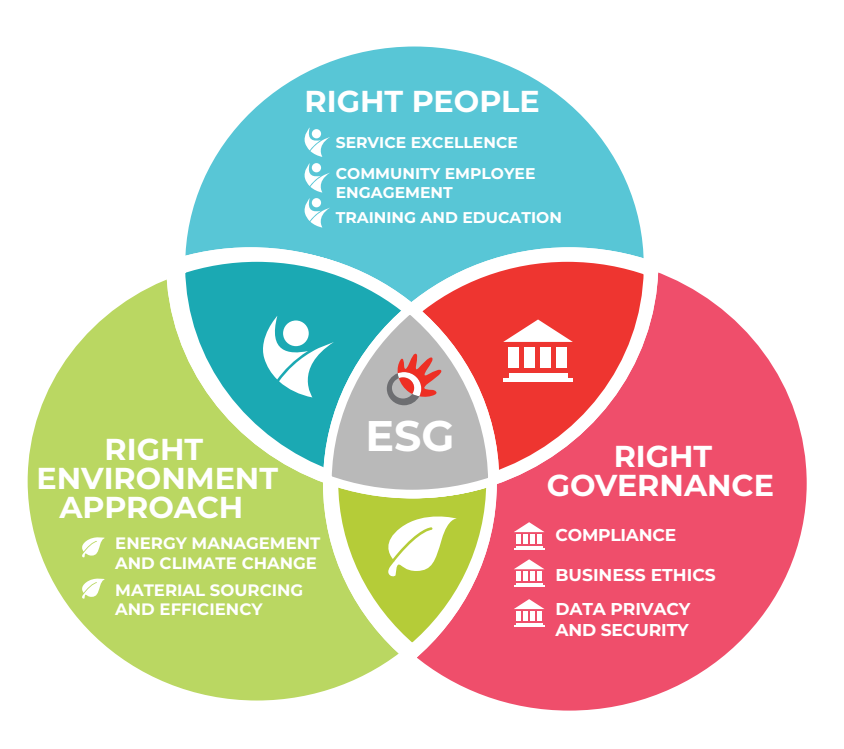
TelkomGroup ESG Pillars and Material Topics